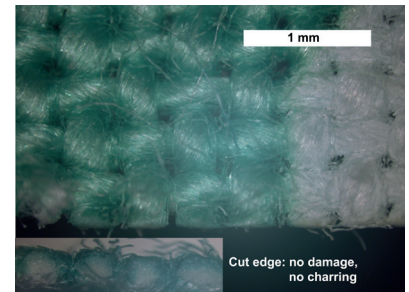
Cutting of Cotton Speed: 10 m / min

High flexibility: many different materials possible. Alcantara, Cotton, Fleece ... High cutting quality and speed.